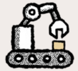
Manufacturing - value add