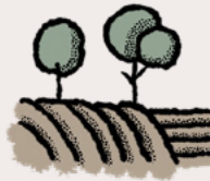
Ag unique terroir for wine and food