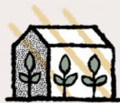
Growing under glass